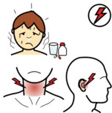
Ako osjetimo bol