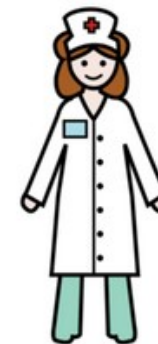
ili medicinskoj sestri