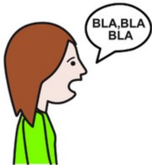
re i emo