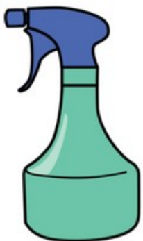
ili sprej za dezinfekciju